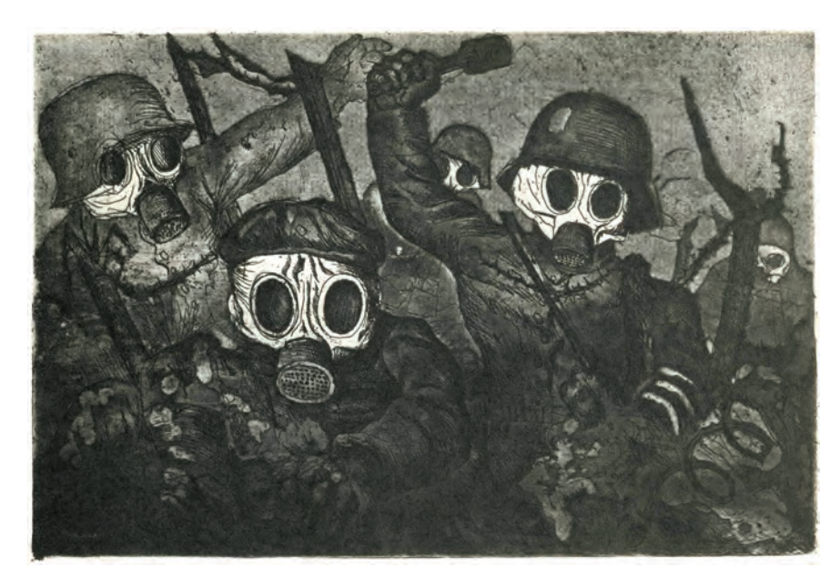
OTTO DIX DER KRIEG 2.2.12 STURMTRUPPE GEHT LINTER GAS VOR 1924 (@ 2013, PROLITTERIS, ZURICH).

The "Flying Unit" carried on its work of noting down the graves as best as it could; however, it was not possible to get close to the more dangerous military zones. Unable to find relatives' graves, the public had started expressing its distress, which was relayed by the press.