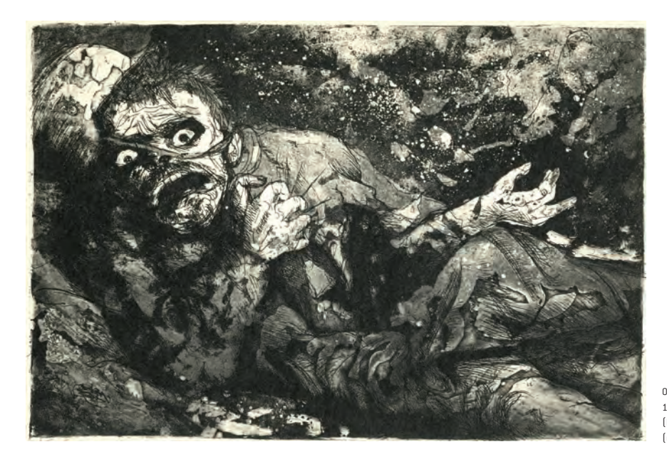
NTTO DIX DER KRIEG 1.6.6 VERWUNDETER, 1916 (HERBST 1916, BAPAUME).

When a soldier died, his family received a photograph of his grave, together with directions to get there and the location of the nearest train station. All families were entitled to this, regardless of the conditions in which the soldier died and regardless of the soldier's rank or social class.